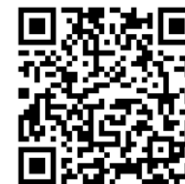
Guide in English